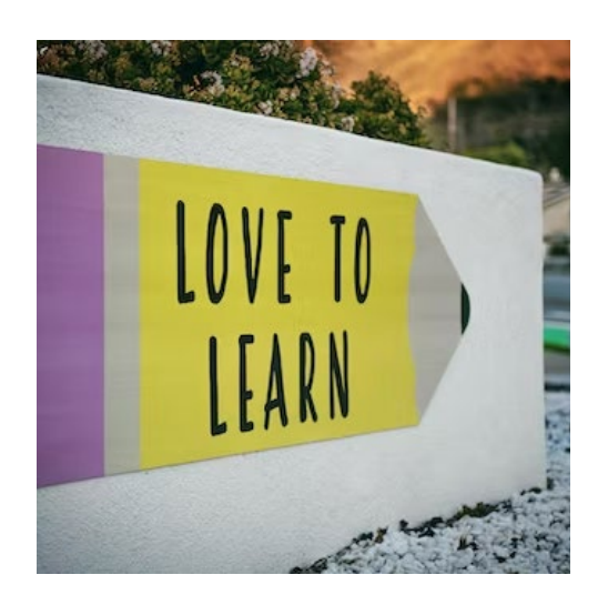
Competency Based Education Models