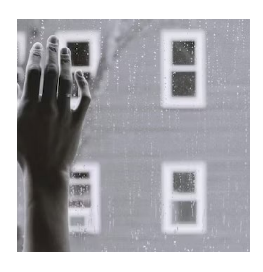
Managing Student Mental Health